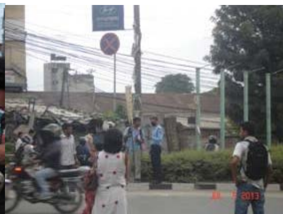
Maetighar Outreach, facing the police