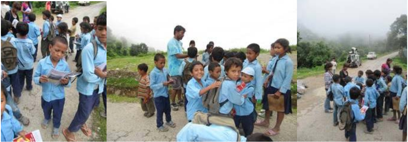
School Children at Arghakhachi

Eleven of us, along with the believers from Kapilbastu, squeezed ourselves in our jeep and drove up and up and up, as such never seen before. We were praying with God to guide our steps and we were looking for a place to park our jeep in a safe place for the whole day. I pulled over and it was just in front of a police station and the in-charge of the station let me park just beside their gate, where no body was going to bother with the jeep. We thanked God for that provision and asked people where the villages were. So we divided up into two groups and our group ended up in a village that happened to be the largest village in the whole district of Arghakhachi, a habitation of 240 houses and every house got the Gospel. Please pray for these souls.