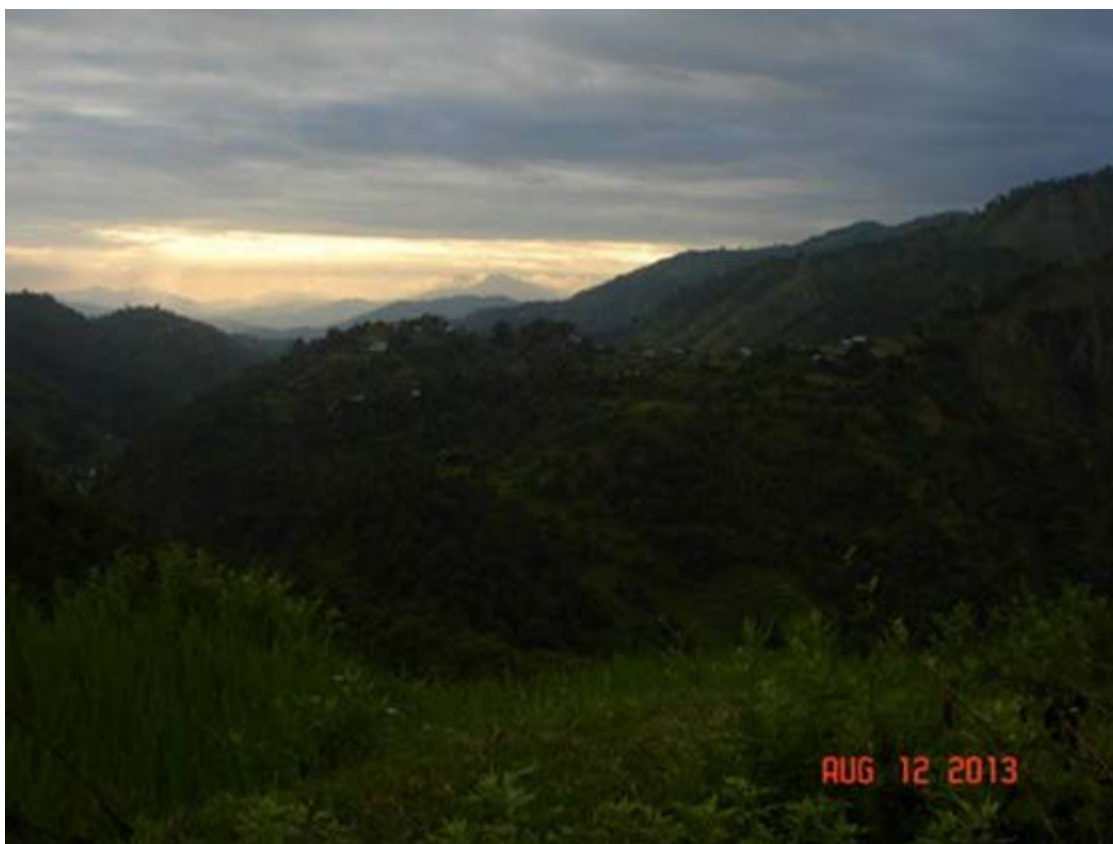
The sunset view from Arghakhachi, Western Nepal

Greetings from Himalaya in the name of Lord Jesus!