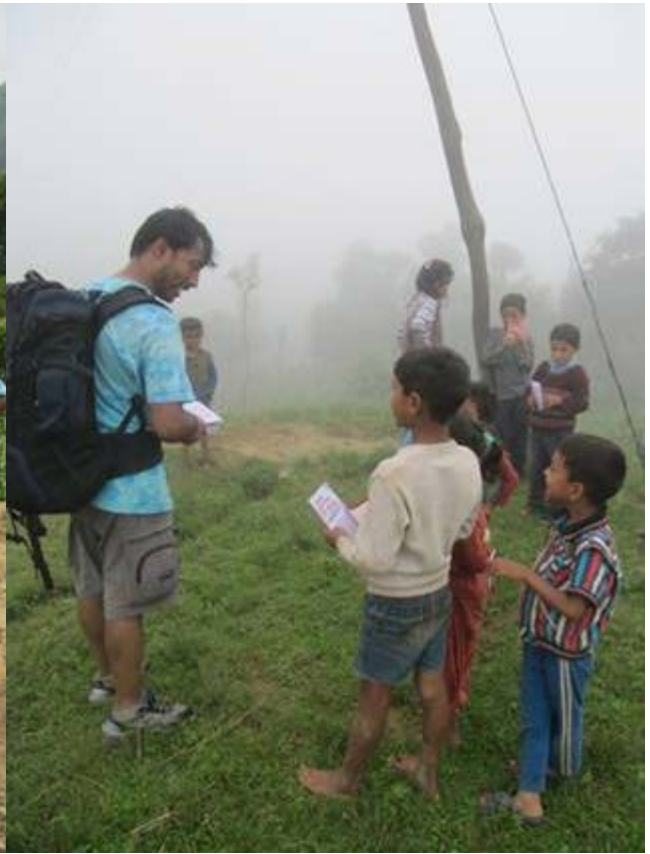
Arghakhachi Outreaches, people had a lot of questions about why we were there and that opened up the way to share the Gospel.