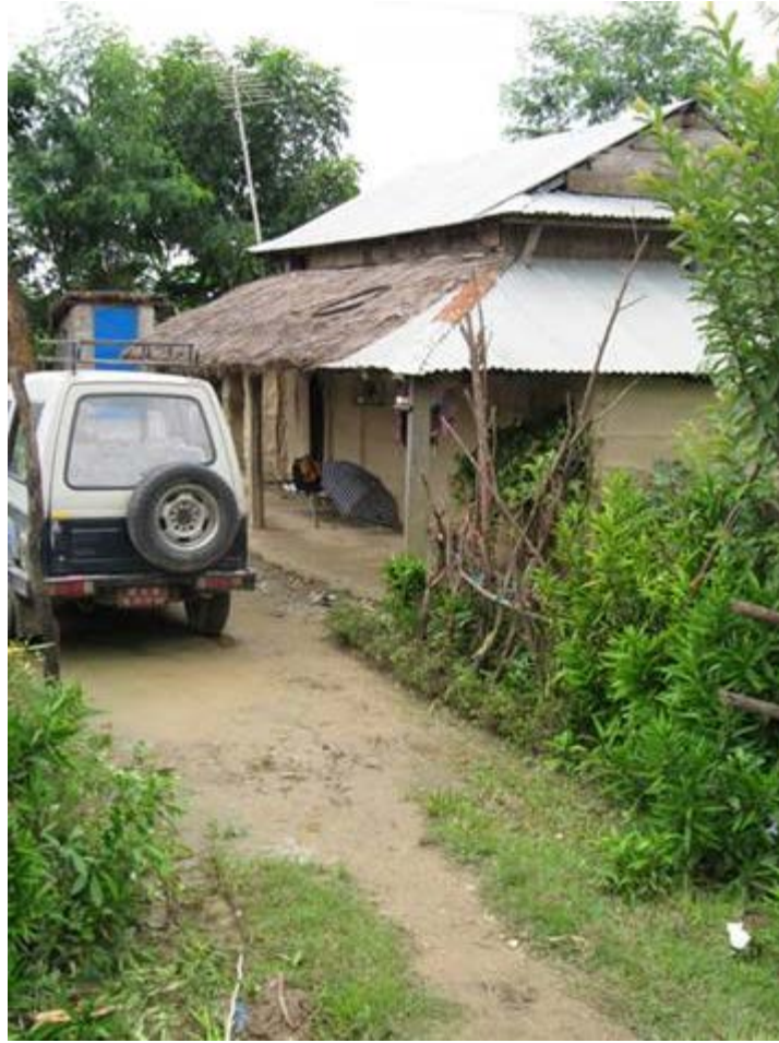
A believer family's house on public land

We drove back to our base at Kapilbastu that night.