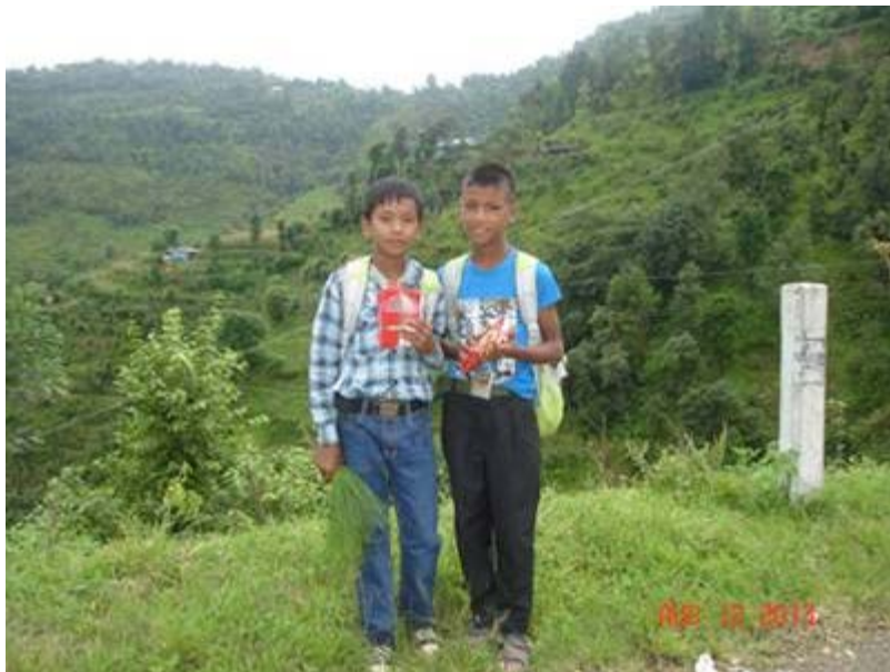
These Tharu tribal believer boys wanted to go with us so much that they had a strike at their homes, did not want to eat, did not want to go the school,