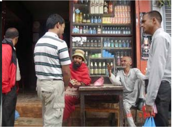
Outreach at Dhulikhel, in front of a bar